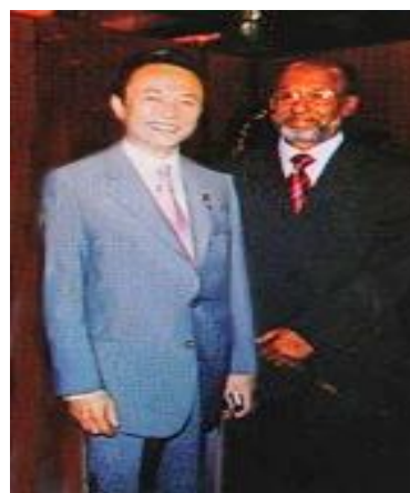
Pic: With former Hon. Prime Minister of Japan, Mr. Shinzō Abe (Left) and his successor, Hon Prime Minister of Japan, Mr. Tarō Asō, during their respective visits in Bangladesh as a leading dignitary representing Japan Bangladesh Chamber of Commerce and Industry (JBCCI).