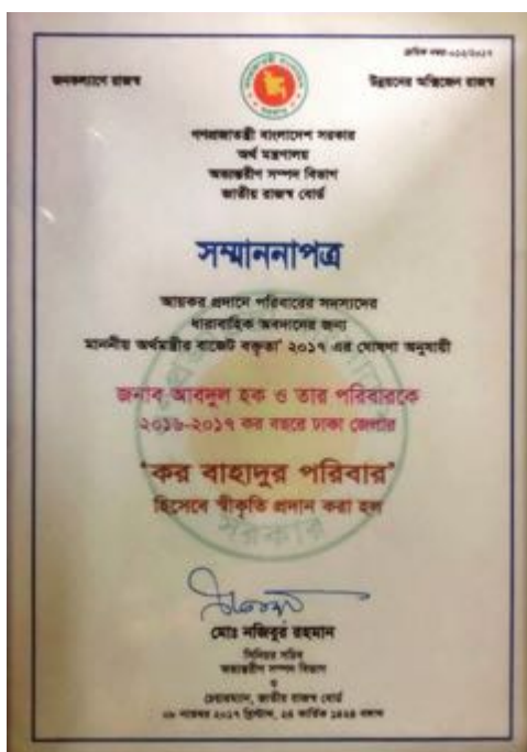
Pic: “কর বাহাদুর পরিবার” recognition from the Govt. of Bangladesh