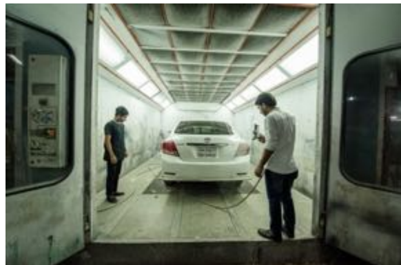
Paint work ongoing in fully equipped paint booth

No single automotive trader in Bangladesh has such comprehensive workshop and support engineering facilities at one place, which will cater all the technical needs of the customers. This facility is now being considered to be expanded and optimally used for other commercial/Industrial operations, like reconditioning of automotive vehicles, using the bonded house concept. Haq's Bay is also