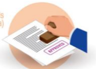
FINAL CONSIGNEE ESTABLISHED IN THE EU