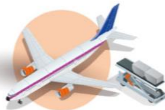
AIR CARGO CARRIERS