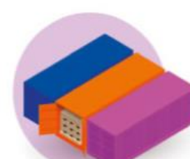
SEA, RAIL AND ROAD TRANSPORT