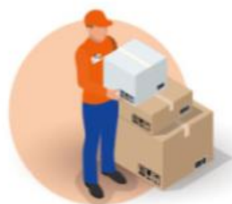
POSTAL OPERATORS INSIDE AND OUTSIDE THE EU