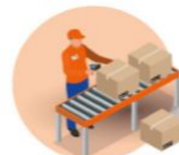
REPRESENTATIVES OF ALL AFFECTED EOs