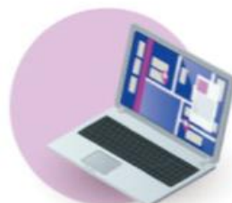
FREIGHT FORWARDING AND LOGISTICS COMPANIES